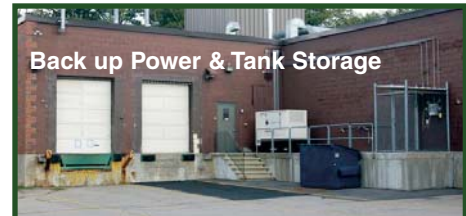
Back up Power & Tank Storage