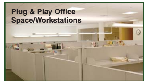
Plug & Play Office Space/Workstations