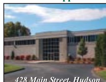
428 Main Street, Hudson

As exclusive listing agent, O'Brien Commercial Properties is pleased to offer 428 Main Street, Hudson, a state-of-the-art, 81,000 square foot, 5-acre, office, R&D, manufacturing and warehouse facility. O'Brien Commercial Properties represented former tenant Electronic Services who, in 2002, invested over $1 million in facility upgrades to better serve their client, Sun Microsystems.