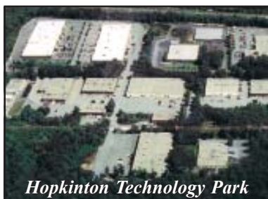
Hopkinton Technology Park

Extensive park-wide improvements have lead to the renaming of former Hopkinton Industrial Park. Now called Hopkinton Technology Park, the 250,000 square foot, 30-acre campus hosts a variety of innovative businesses, including Pittney-Bowes, Invitrogen, Quality Control Biochemicals, Vertical Communications, LTX, California Closets and many more. The Hopkinton Technology Park, a master-planned commerce center offering tenants identity, amenities, and expansion capability, can currently accommodate a variety of space requirements, from 750 to 20,000 square feet of contiguous office, R&D, manufacturing and warehouse properties.